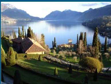
The Bellagio Study and Conference Center is located on scenic Lake Como, Italy